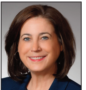
Sue Frost Sacramento County Supervisor

and mental health programs. This isn't just about taking back control of our streets; it's about taking responsible steps to provide real solutions that address both the symptoms and root causes of homelessness.